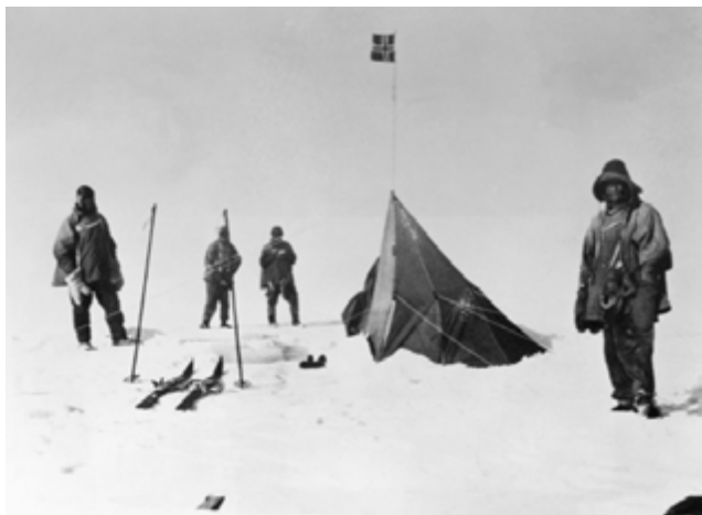
Robert Scott and his party arrive at the South Pole, only to find the tent left by Norwegian explorer Roald Amundsen, who had arrived at the Pole one month earlier.